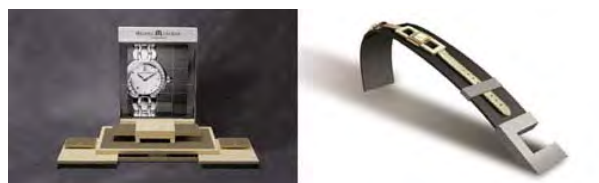
Maurice Lacroix / Cerruti

Genoud, which has been in the service of the most prestigious Swiss watch brands since 1964, knows how to turn a difficult situation to its advantage. Confronted with a slowdown in demand coming from the haut de gamme segment, Ateliers Genoud decided to vigorously develop its activities in the fashion and mid-range sectors. Now, the prestige brands are also proposing more accessible lines and are thus moving into these segments. As a result, they depend on the professionalism and experience of Ateliers Genoud to fill their needs in these sectors as well.